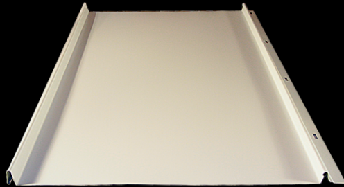
2 Rib Panel