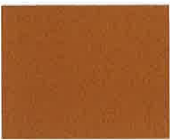
Metallic COPPER **