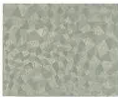
Non-Painted ACRYLIC COATED GALVALUME ®